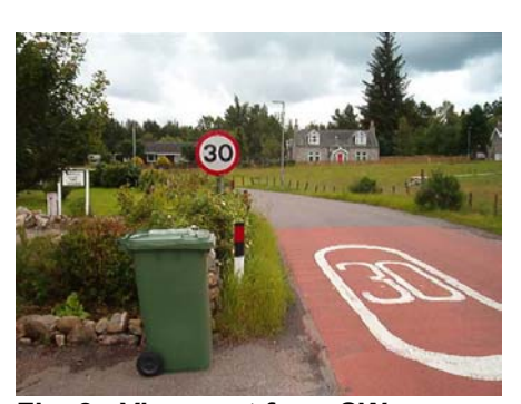
Fig. 8: View east from SW access