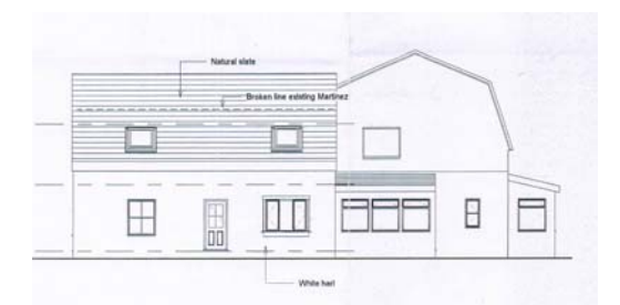
Fig. 5 : proposed Martinez replacement with Kimberley gable visible to the right