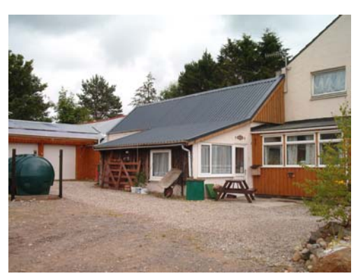
Fig. 4: Martinez, attached to