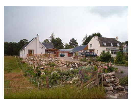
Fig. 3 : View of Lindelea, Martinez Kimberley and Kimberley.

and is an L shaped dwelling, of one and a half storeys, with a number of garages incorporated within the eastern wing of the L. 'Lindenlea' is of relatively recent construction and is located in the north western corner of the site.