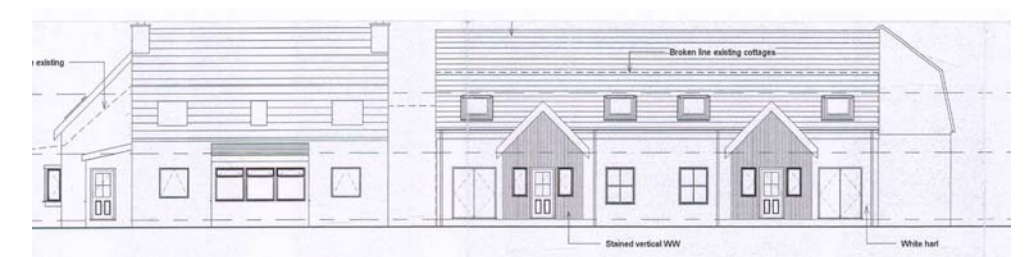
Fig. 4: proposed replacement Park Cottages as seen in the context of their relationship with Kimberley (left) and Kensaleyre (gable visible to the right)

proposed on the front of each property, with a pitched roof and a centrally positioned front door. The porch is positioned between a double patio door on one side and a 'sash and case' style window on the other. The porch is proposed to have an external finish of vertical timber cladding. All other external walls would have a white harl finish. all under a natural slate roof. No details have been provided to clarify whether the windows and doors in the property are proposed to be timber or uPVC. Each of the two proposed cottages has an identical internal layout. Ground floor accommodation includes a living room, kitchen and utility, with a door from the utility providing access to a small area of open space to the rear of each of the properties. Two bedrooms and a bathroom are proposed on the upper floor level. As detailed earlier, the two proposed replacement Park Cottages are not on the same footprint as the existing structures. They are proposed approximately 1.2 metres forward of the existing position, thereby facilitating a separation of the new dwelling units from the neighbouring property, Kensaleyre, where a boundary wall is shared at present.