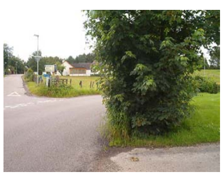
Fig. 7: Restricted visibility at