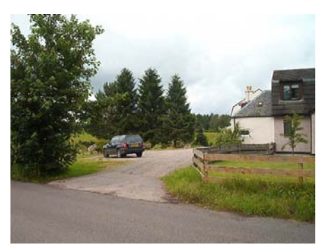
Fig. 6: Eastern access eastern