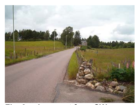
Fig. 9: view west from SW access

26. A site meeting was subsequently held between an official of Highland Council's Area Roads and Community Works Division and the applicant and his agent<sup>4</sup> where the existing and proposed access arrangements were examined. Agreement was eventually reached on the proposed two new Park Cottages being served from the existing