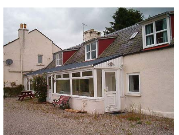
Fig. 2: Park Cottages